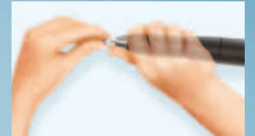
K-ERGOgrip (above): Ergonomic holding position, gentle on the wrist. No "bending" as with other handpieces (example below)