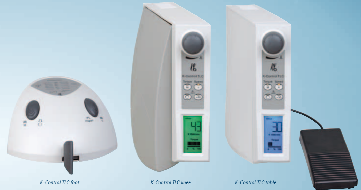
K-Control TLC foot