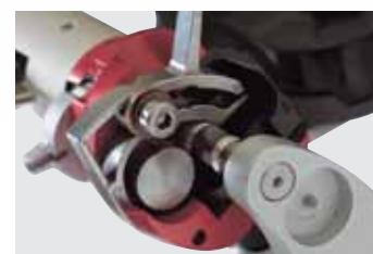
Experience precision in the smallest detail. Rigid centric lock of Inox steel for perfect static occlusion.