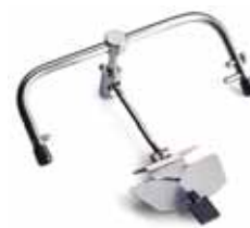
Occlusion inclination pointer, for full dentures APFnt