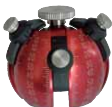
Fully adjustable incisal plate for anterior/canine reconstruction