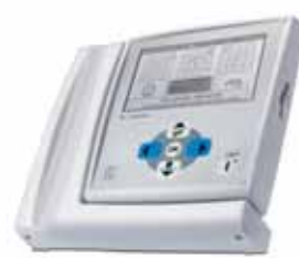
Working together with the electronic measuring system KaVo ARCUS ® digma, the KaVo articulator PROTAR ® evo offers unbeatable efficiency and precision.