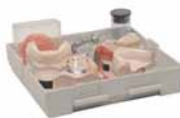
KaVo LOGIcase, the ideal transport solution between the laboratory and the surgery.