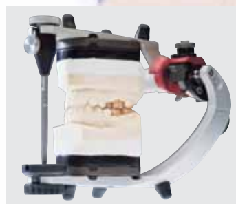
The elegant design of the KaVo PROTAR ® evo presents the finished prosthesis at the highest level.

The new generation KaVo PROTAR ® evo offers better adjustment possibilities, due to the refined adjustment scale, thereby increasing precision and helping to reduce costs.