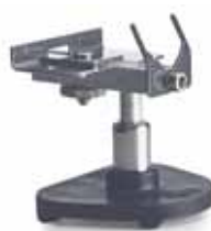
Upper jaw model positioner for APFnt