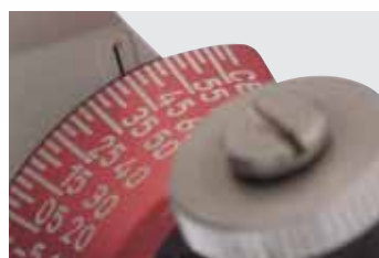
Optimum setting of the patient's data by use of the fine dimension adjustment scale.