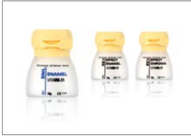
Fig. 1 VITA VM 11 effect materials