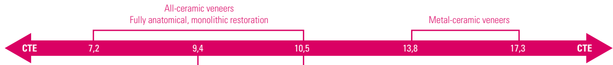
+ Metal-ceramic veneers