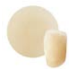
+ Press ceramics