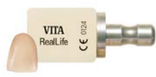
+ Fine-structure feldspar ceramic blocks